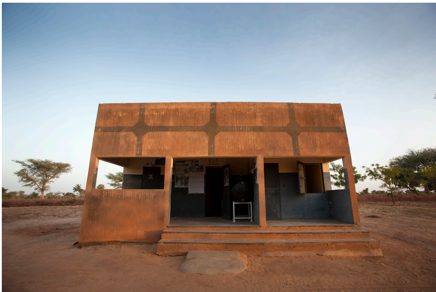
CASE DE SANTÉ , COMMUNITY HEALTH WORKER POST, IN VILLAGE OF SARKIN YAMMA SAFOUA, NIGER

Learn how UNICEF is using iCCM to improve child health with equity in Niger and Mali from the perspective of mothers, village leaders, and community health workers at http://uni.cf/JctHr7 , and watch two videos on the subject at http://bit.ly/M1rnIj (Niger) and http://bit.ly/LevY0F (Mali).