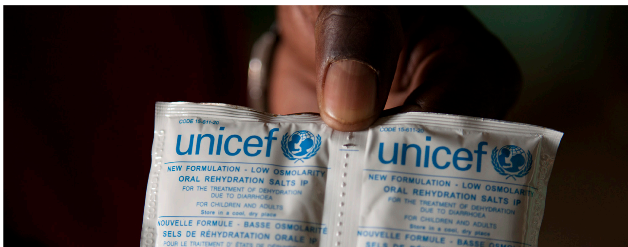
COMMUNITY HEALTH WORKERS IN THE DISTRICT OF SELENGUE, MALI PROMOTE THE USE OF PRE-PACKAGED REDUCED OSMOLARITY ORAL REHYDRATION SALTS (ORS) TO MANAGE DIARRHOEA

Response: UNICEF is developing a process for decentralized health system strengthening which includes, as one component, the improved use of data for corrective management decisions. Guidelines and a toolkit have been developed for this purpose and are currently being field tested. In Niger, UNICEF has supported the development of monitoring mechanisms and tools which are linked to microplanning at district and sub-district levels. Monitoring at the lowest, most peripheral levels of the health system (e.g. Integrated Health Centers and Health Posts - the latter being the workspace of the community health worker) is currently being coupled with specific microplans at these levels. This effort is expected to improve management for results by linking localized situation analysis and continuous monitoring to decentralized management response. (See Case Study 6 below)