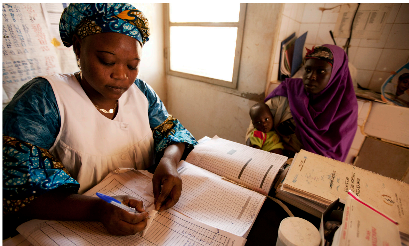
NURSE WITH A PATIENT AT A CENTRE DE SANTÉ INTÉGRÉE IN SARKIN YAMMA, NIGER, A HEALTH CENTER AND REFERRAL RESOURCE FOR COMMUNITY HEALTH WORKERS

In the months following the assessment, there was improved access to iCCM services, better data reporting, and increased engagement of programme managers and GHS leaders. This case study highlights the importance of simplified data systems, and collecting and distributing data that can be used by managers to guide programme decisions. [Source: UNICEF Ghana, Child Survival and Development Section. Lessons Learned Document. May 13, 2011.]