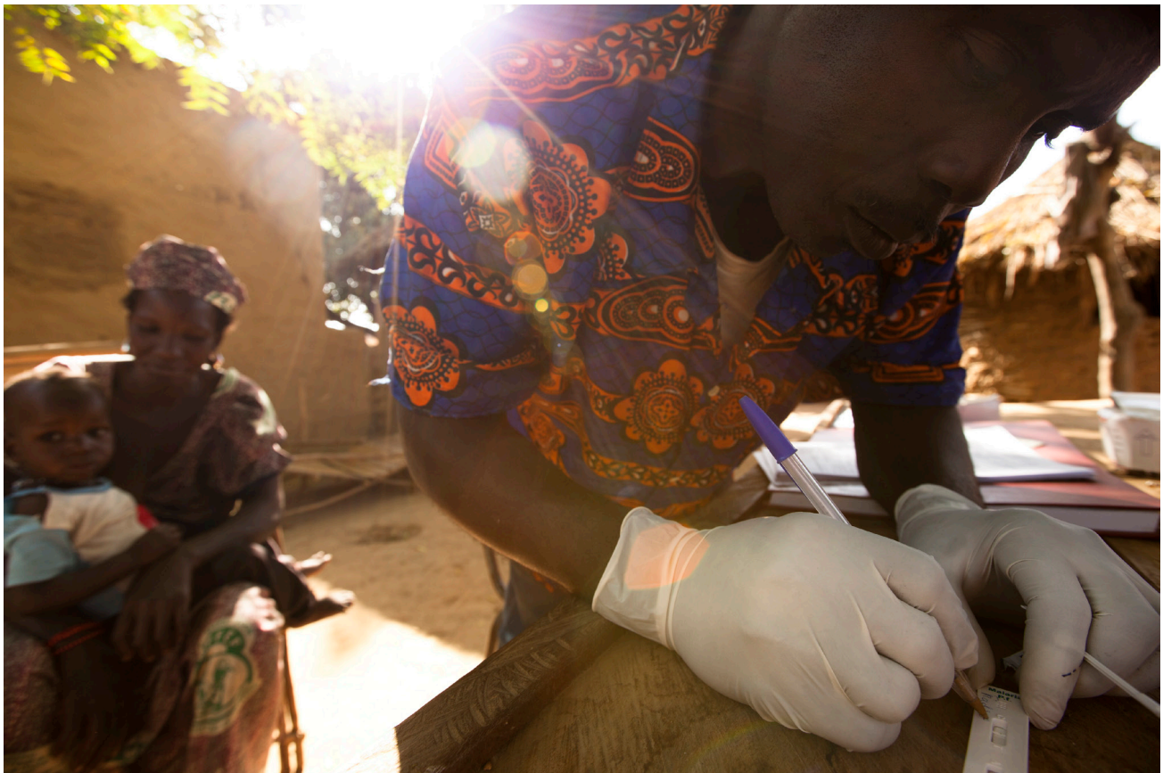
COMMUNITY HEALTH WORKER IN VILLAGE OF SAMATAN, MALI PREPARES A RAPID DIAGNOSTIC TEST (RDT) FOR MALARIA