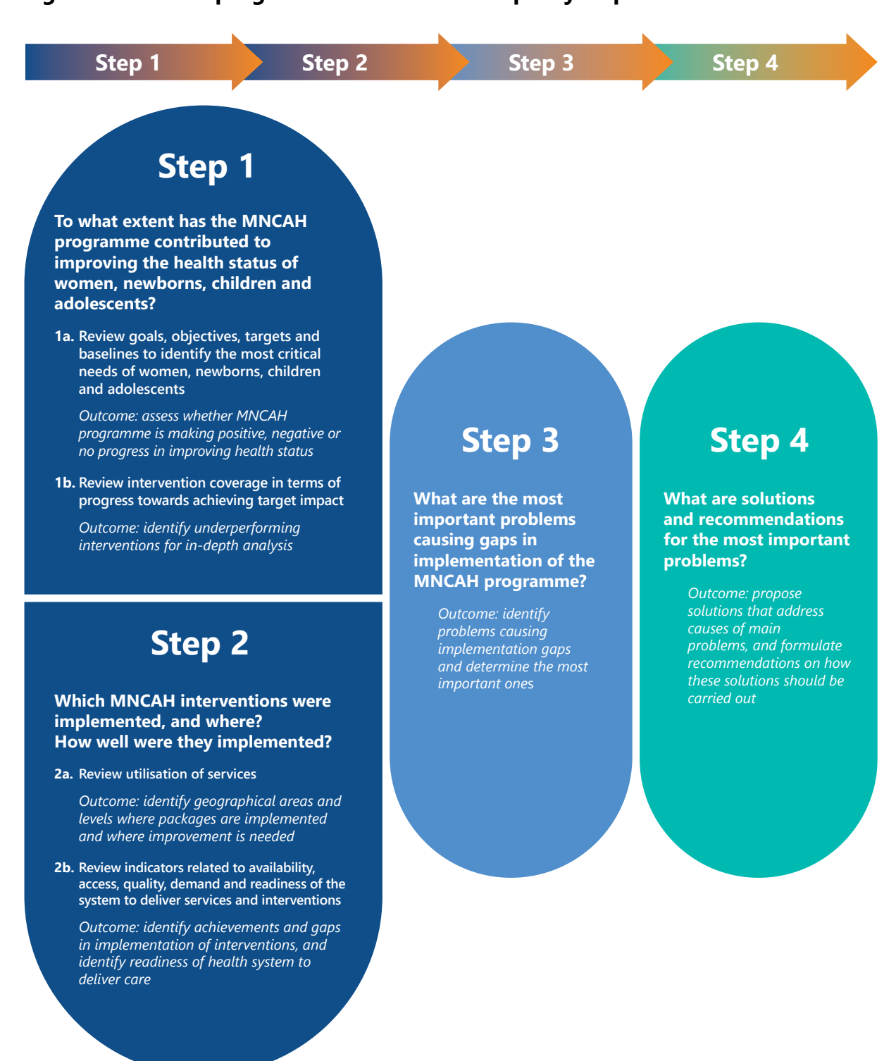
Figure 1. MNCAH programme review workshop: key steps

Table 1 shows a sample 4-day agenda for an MNCAH programme review workshop. The agenda may be condensed or lengthened to suit the country's needs, but the suggested steps should be followed in this order because the sequence matches the logic flow of the programme review process (Figure 1).